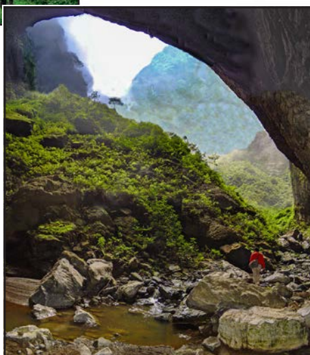
Left: One of the giant natural bridges at San Qiao, seen from the tiankeng floor. Above: Exit from Erwang Dong into Qingkou Tiankeng.