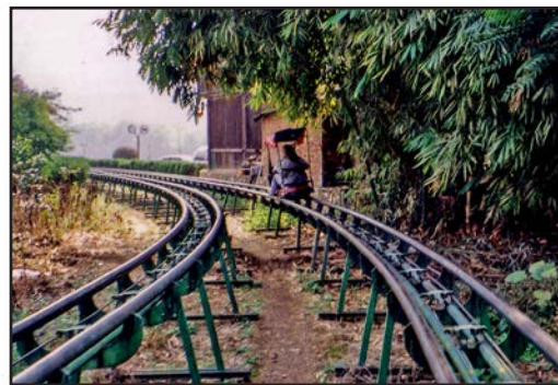
Go-kart to Guanyan Dong – beats walking.

We stopped off near Fengshan for a relaxing raft ride through Sanmeihai Dong (Three Doors Seas Cave). This is a new tourist site created by easing boat access through the doline lakes connected by caves at the exit from Mawang Dong (a major trunk cave mapped by the China Caves Project back in 1989). The caves are