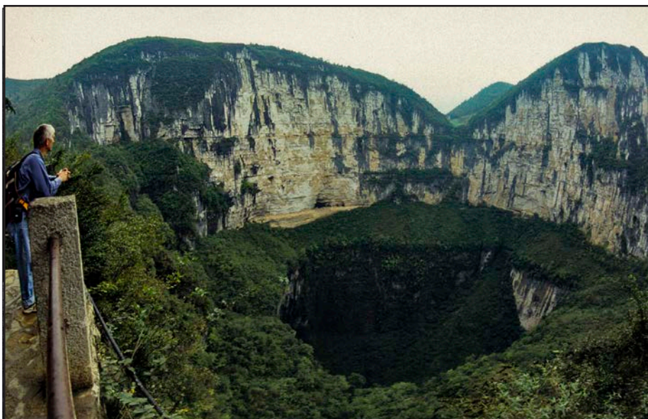
Andy Eavis at the lip of Xiaozhai Tiankeng.

Another short bus ride. Past more huge cave entrances and some lesser tiankengs. Then we were dropped off at the foot of a long flight of steps towards the top of a cone hill – a new tourist trail to a viewpoint above the giant Dashiwei Tiankeng. Over 400m across, this has collapsed outwards to create a perimeter of vertical walls cutting through three steep conical hills, with the high point 613m above the floor. It is truly amazing. Hidden behind boulders on its floor, a few kilometres of large river passage have been explored, largely by YRC members on the China Caves Project. But we felt that a long rope pitch to the tiankeng floor was best appreciated from above, and would merely impinge on one of the most spectacular days of spectacular karst that any of us had experienced. Leye