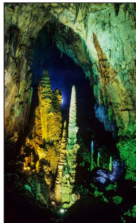
Tall stalagmites in the main passage of Furong Dong.

First stop, Furong Dong, just east of town. It had been found about 15 years ago, when locals dug through a draughting choke in a rock shelter – and broke straight into a splendid passage 40m high, 20m wide. Stuffed full with decorations, this has made a superb showcave. Flowstone has been dated to 160ka, and there is